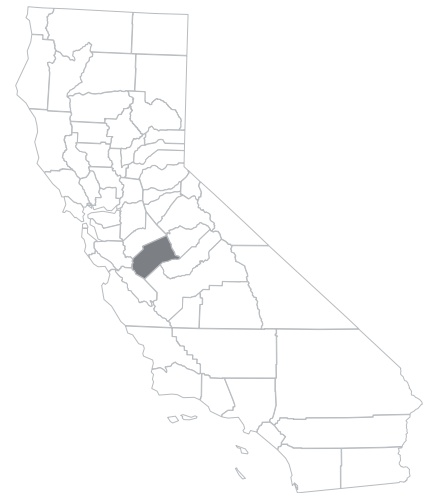
MERCED COUNTY, CA

UC Merced influences both the lives of its students and the county economy.